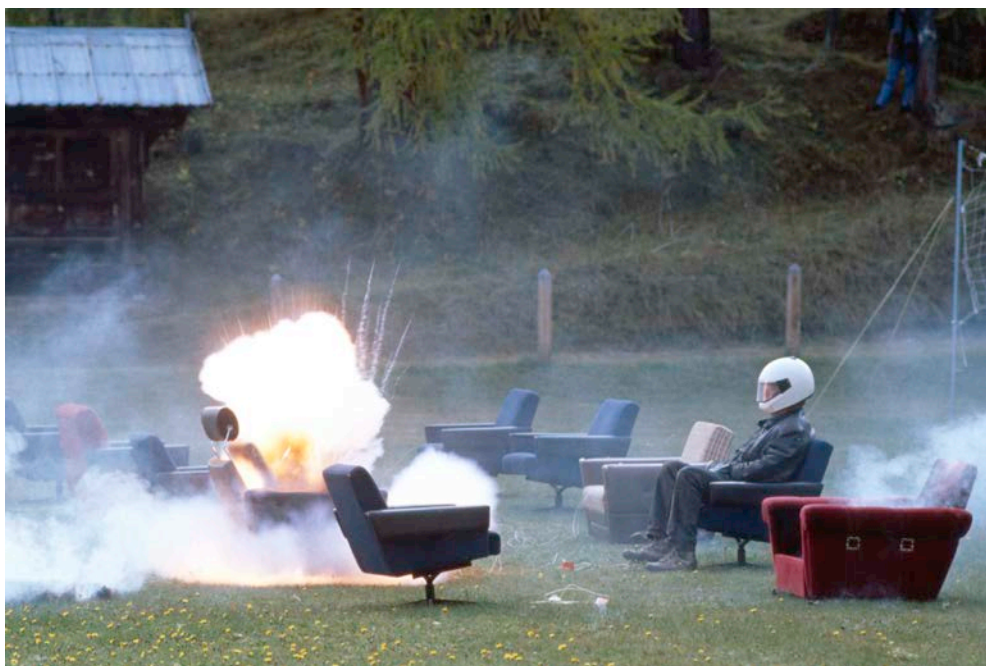
Roman Signer, Kleine Ereignisse Hotel Castell, Zuoz, 1996

His “small and large happenings” as he calls them, have brought him international fame. Roman Signer, born in 1938 in Appenzell, Switzerland, has become one of the most important sculptors in the world. The starting point for his unique creative process is a concept of sculpture that is disengaged from the object, making processes visible. Everyday things form the basis of his work. The objects he uses, such as tables, chairs or kayaks have a distinct character of their own. However, Roman Signer does not use them for their typical functions; instead, he transforms them in a way that exposes the multiple potential layers of meaning in their presence as physical objects. Familiar things become strange; functional things appear absurd. Both the exhilarating and the abysmal qualities of everyday life become visible.